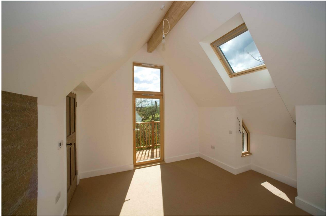
Interior 2 (including rammed earth wall on left)