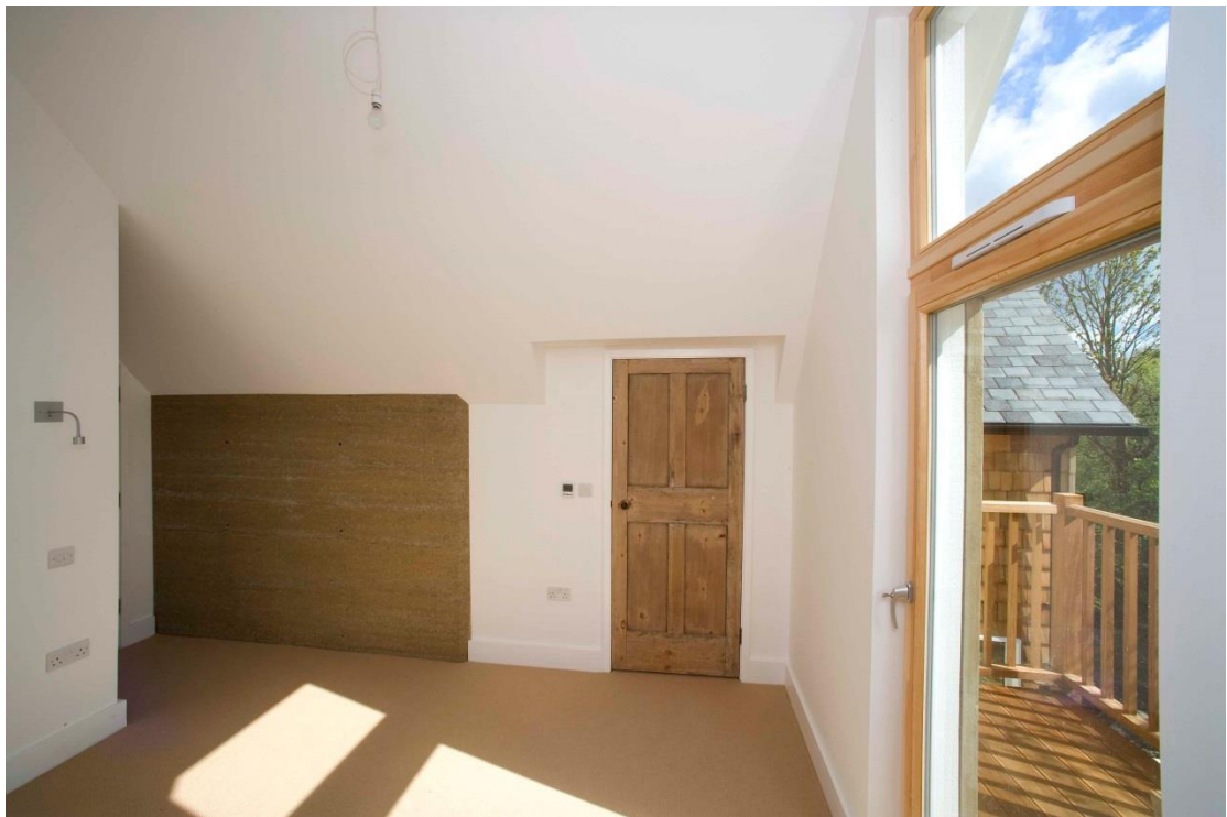
Interior 3 (including rammed earth wall)